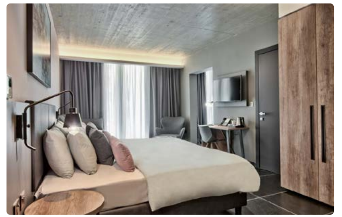
Number 11 Hotel